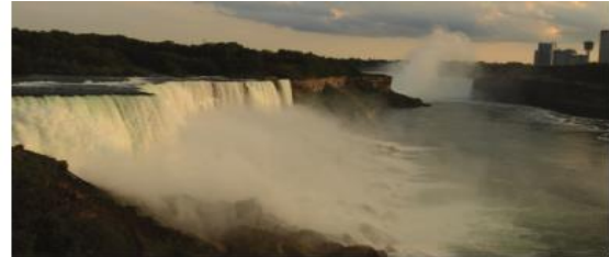
Niagara Falls is the collective name for three waterfalls that cross the international border between the Canadian province of Ontario and the USA's state of New York. They form the southern

determine this category. It reflected on the figure below.