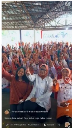
Figure 3. Group Photo