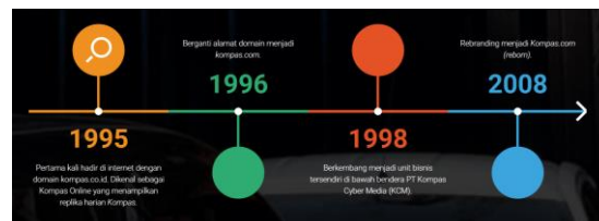
Figure 3. Kompas.com's Journey

This research discusses three news articles on the kompas.com page entitled "Jengkel akan Kerja Menteri, Jokowi Sampaikan Ancaman Reshuffle", "Isu Reshuffle Menguat, Kursi Menteri Siapa Dapat", and "Jokowi Umumkan Reshuffle, Ini 6 Menteri Baru Kabinet Indonesia Maju"