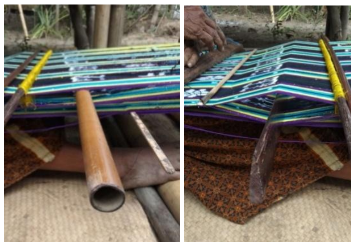
Figure 3: Ame (Made from moke or arak tree which functions to open a stretch of cloth) So that it can be surpassed by my book