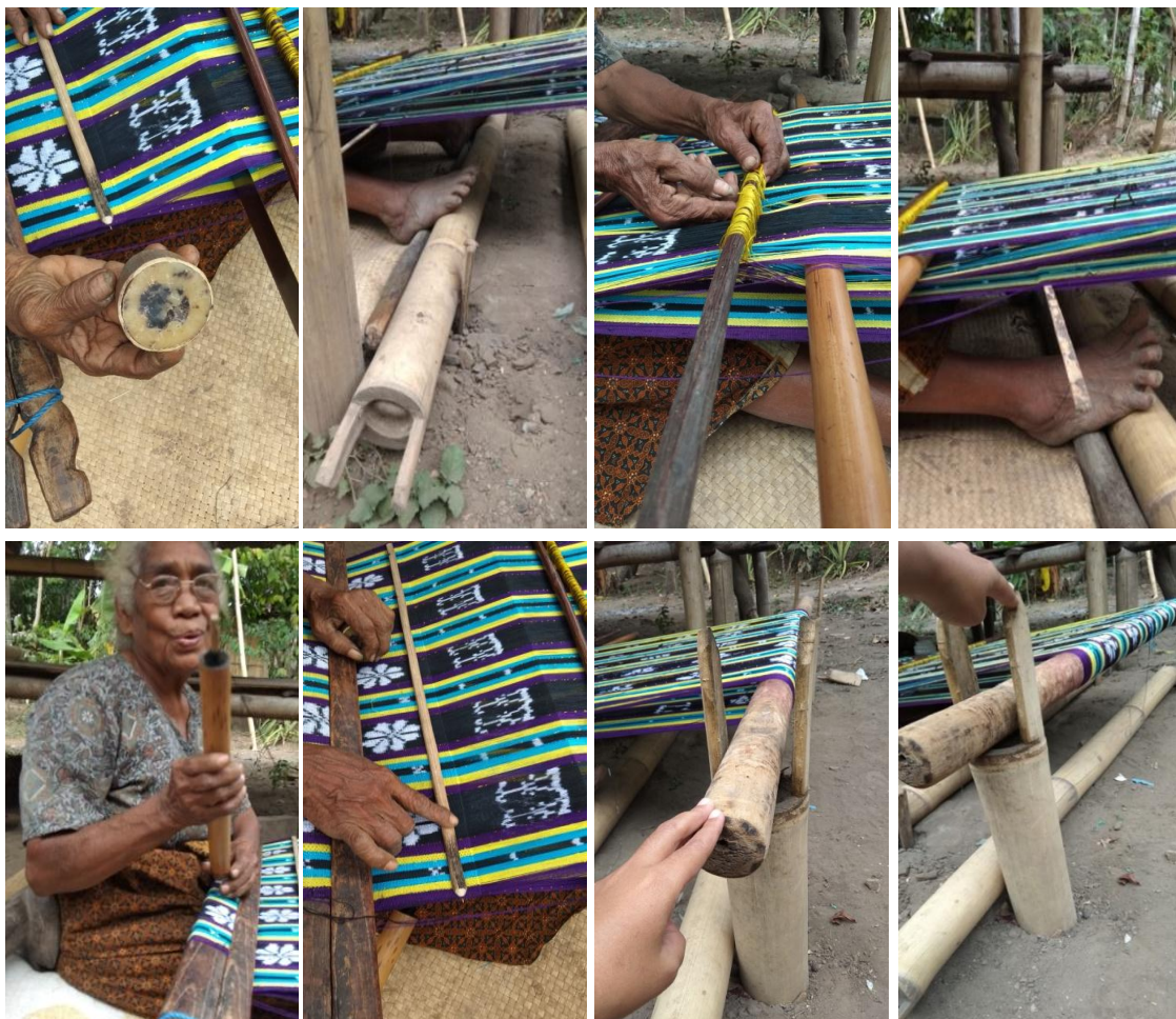
Figure 4: Components of Hobapojo looms

Regarding the names of the looms, people named them using local languages. So the name of the loom will be different if we are in different districts. Here are the names of looms from the Nagekei language based on the words of mama Mathilda Ito.