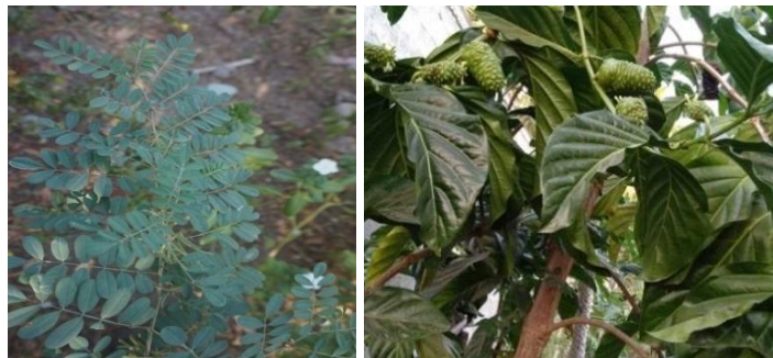
Figure 2: The natural coloring of Hobapojo textiles

Hobapojo is made by dyeing technique in which the threads are arranged in a vertical loom, then tied using palm leaves or raffia ropes in the form of motifs. After being tied, the yarn is released from the tool, then dyed using natural dyes, including from the root "Kobo" or morinda, which is the root of the noni forest as a producer of red color, and the leaves of the indigofera shrub or tarum (tau) as a producer of blue color.