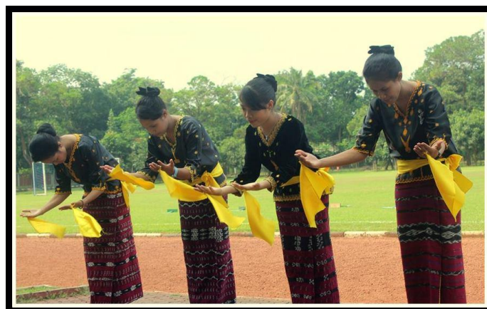
Figure 8: Tea Eku Dance

Tea Eku dance clothing is a special dress of the Tea Eku dance, in the form of black, red and Nagekeo songket.