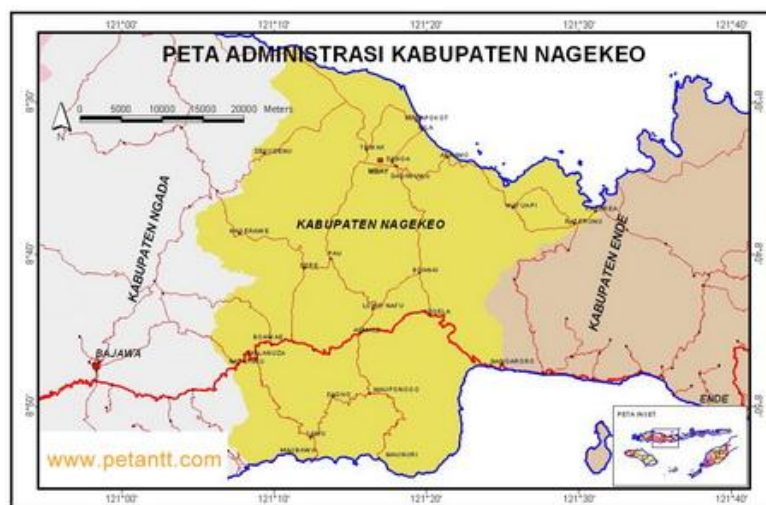
Figure 7: Map of Nagekeo Regency Source: (NTT, 2008)