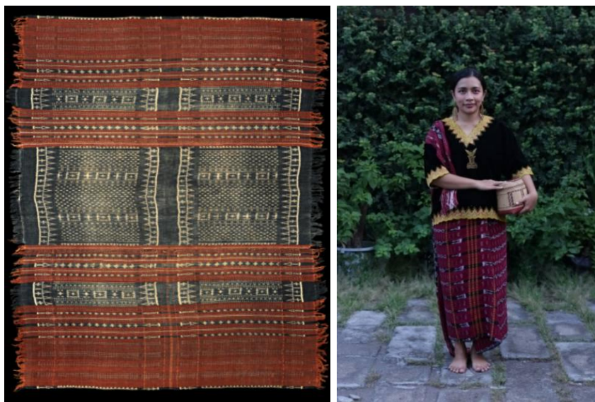
Figure 1: The history of Hobapojo and its current changes

The benefits of hobapojo can be understood from the traditional expression " hoba tau tago, sada tau bago ". This means "sarong is worn to protect the lower body, and the shawl is used to protect the upper body". Hobapojo has a very intimate meaning with women as users. Since birth, traditionally, a baby will be brought hobapojo from his mother's family which is called "wua" or sling which is a form of prayer and blessing so that children grow healthy and well.