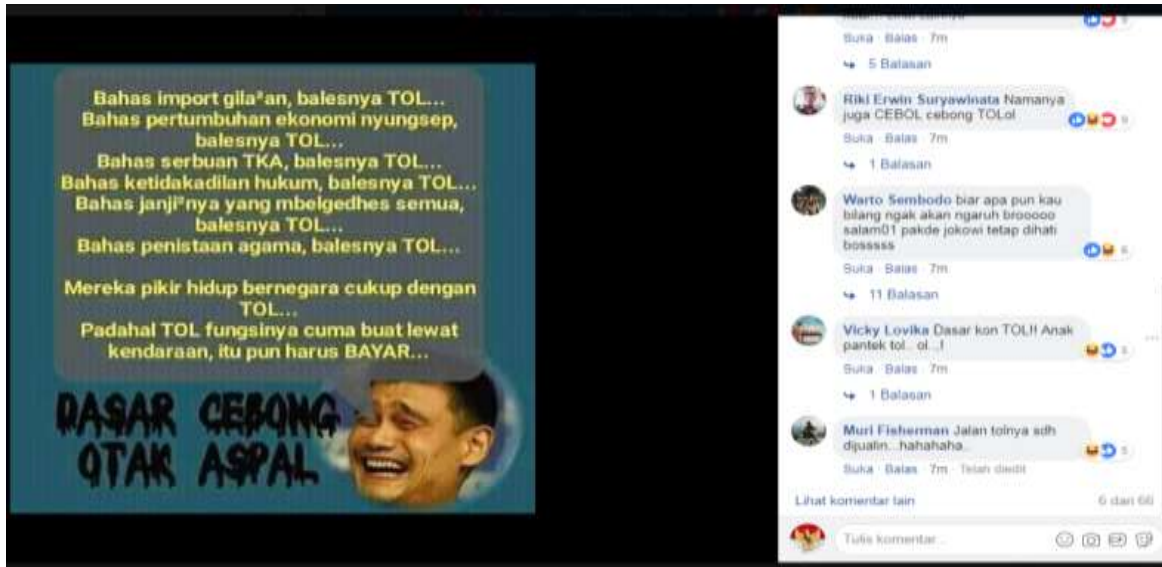
Figure 2: Language of Kampret/Bats group

These two language samples taken and selected will be discussed / analyzed with two approaches, namely the logical-rational approach and the ethical-normative approach.